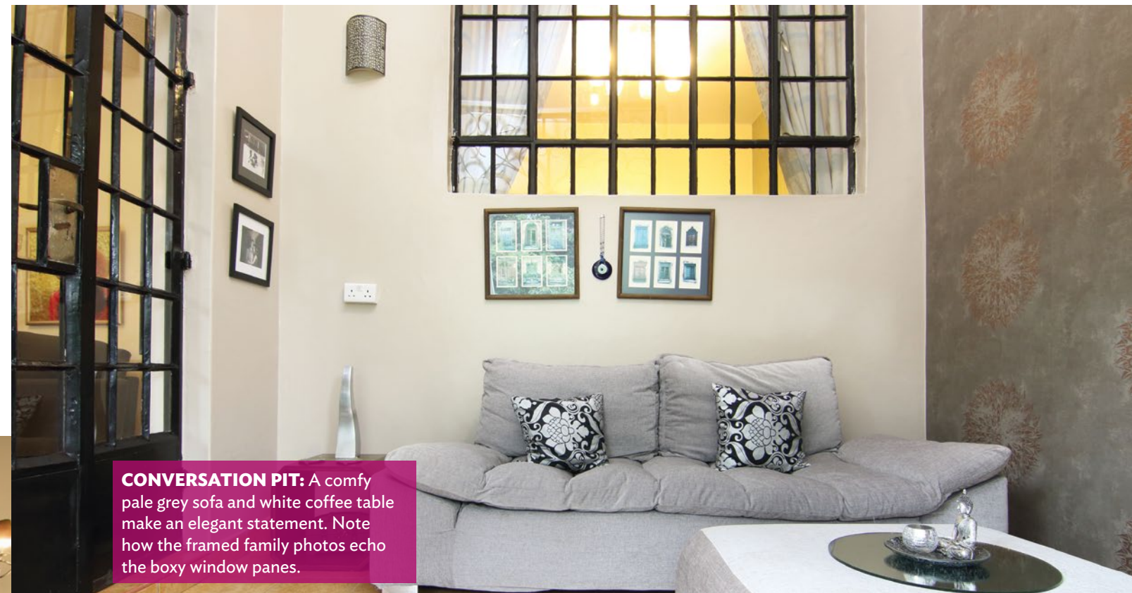
CONVERSATION PIT: A comfy pale grey sofa and white coffee table make an elegant statement. Note how the framed family photos echo the boxy window panes.

Turning a four-bedroom Nairobi townhouse into a warm and welcoming home for family and friends is easy when you're Shelina Mediratta. You stick to a neutral colour palette, and you only fill your home with pieces you love.