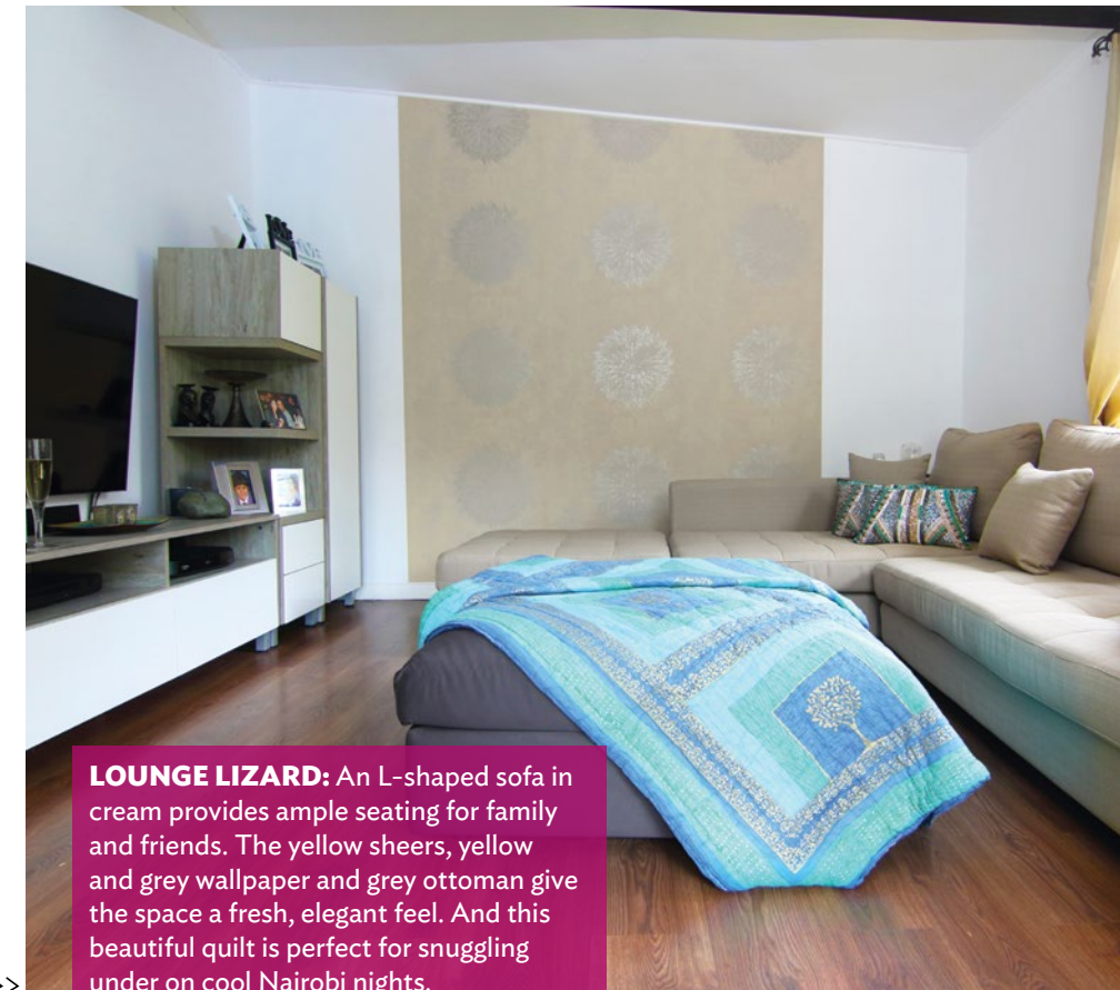
LOUNGE LIZARD: An L-shaped sofa in cream provides ample seating for family and friends. The yellow sheers, yellow and grey wallpaper and grey ottoman give the space a fresh, elegant feel. And this beautiful quilt is perfect for snuggling under on cool Nairobi nights.

The art in her home ranges from bright, bold paintings to a Zanzibar chest, a wall-mounted Lamu door and >>