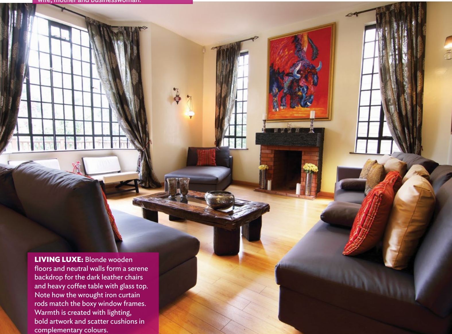
LIVING LUXE: Blonde wooden floors and neutral walls form a serene backdrop for the dark leather chairs and heavy coffee table with glass top. Note how the wrought iron curtain rods match the boxy window frames. Warmth is created with lighting, bold artwork and scatter cushions in complementary colours.

Wood, wrought iron and warm, personal touches are what make this home stand out from the crowd. WORDS: IRENE OUSO.